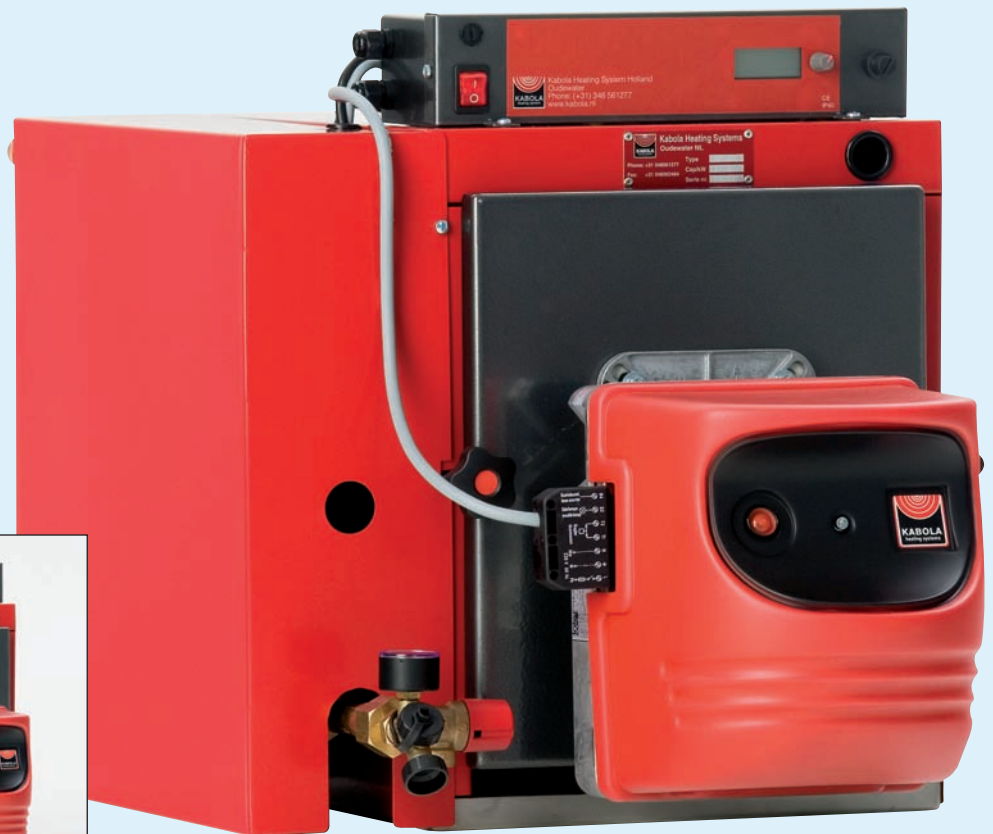
HR 500 combi